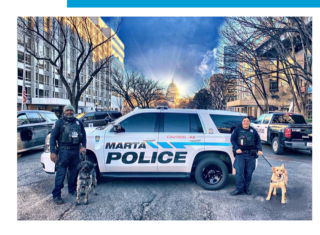
K9 Units at the 2021 Presidential Inauguration