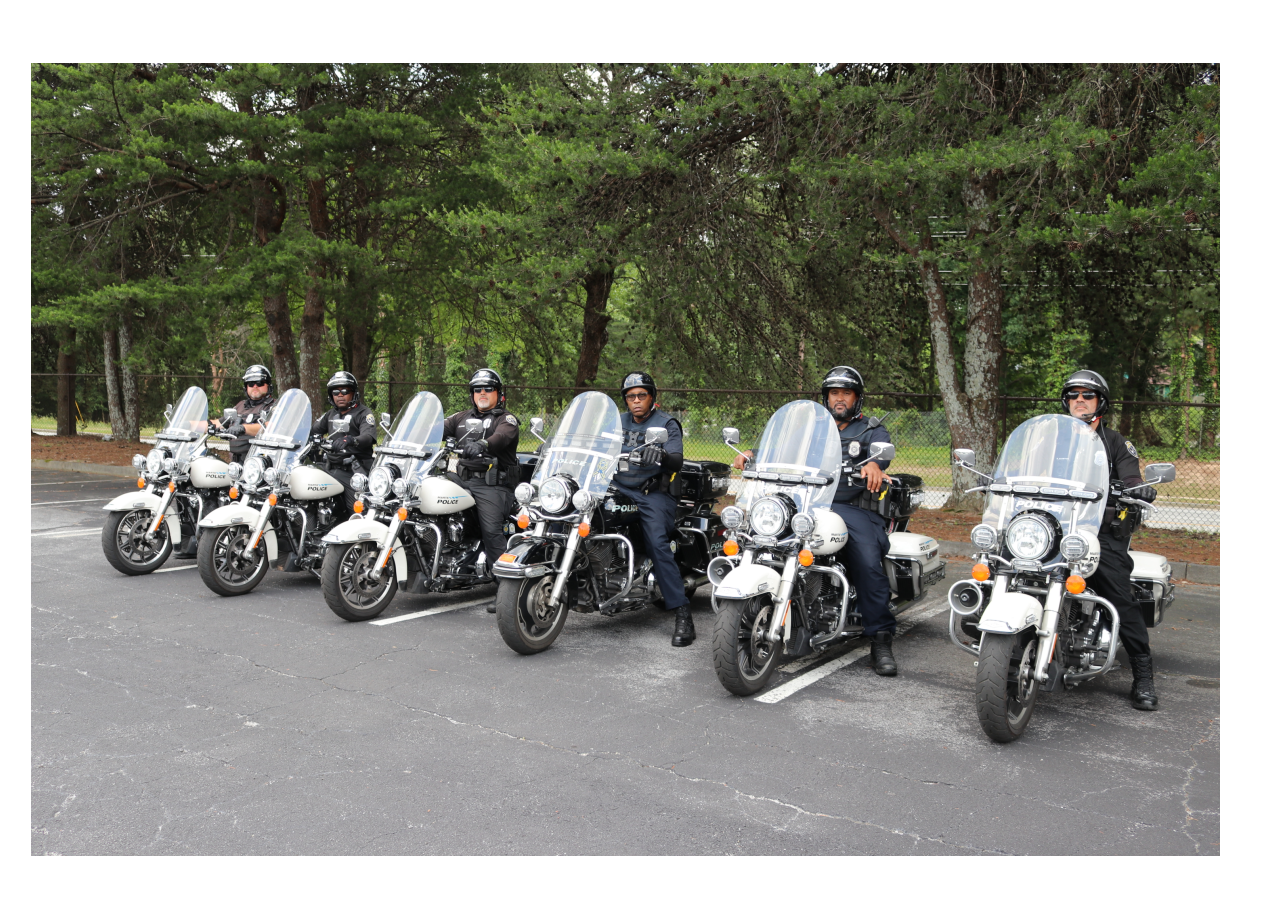
2021 Motors Unit